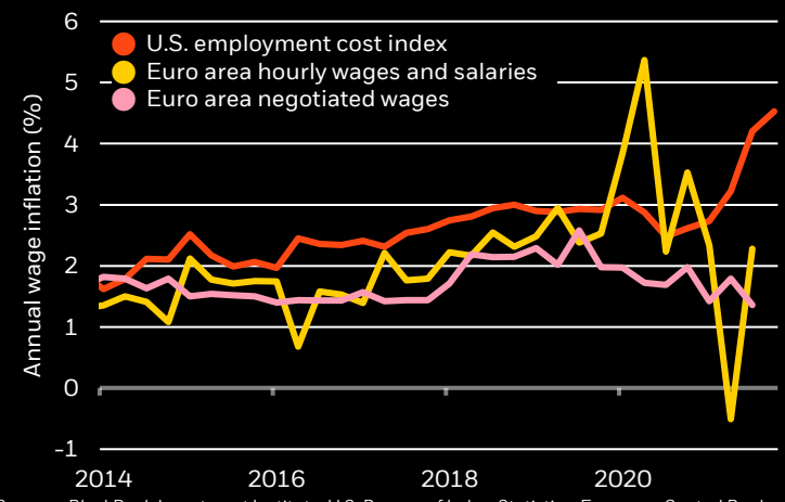
Sources: BlackRock Investment Institute, U.S. Bureau of Labor Statistics, European Central Bank, with data from Haver Analytics, February 2022. Notes: The chart shows year-on-year wage inflation measured by the employment cost index in the U.S. (orange line), hourly wages and salary costs in the euro area (yellow line) and euro area negotiated wage settlements (green line).